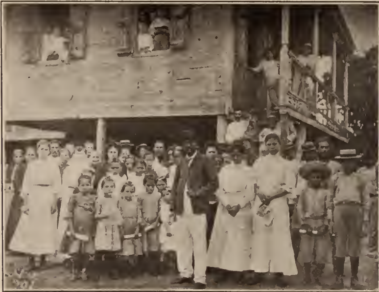
A MISSION SUNDAY-SCHOOL AT ESPINAL, PORTO RICO

at whose house the first service was held is now an officer in this church, and one of his family is a student for the ministry in the theological training-school at Mayaguez.